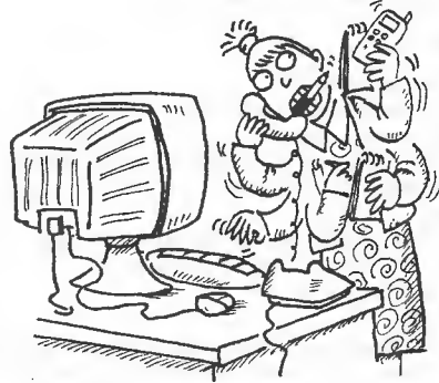
operating at full capacity

an advertising campaign an initiative an operation a product a programme a project a scheme a takeover bid