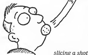
slicing a shot