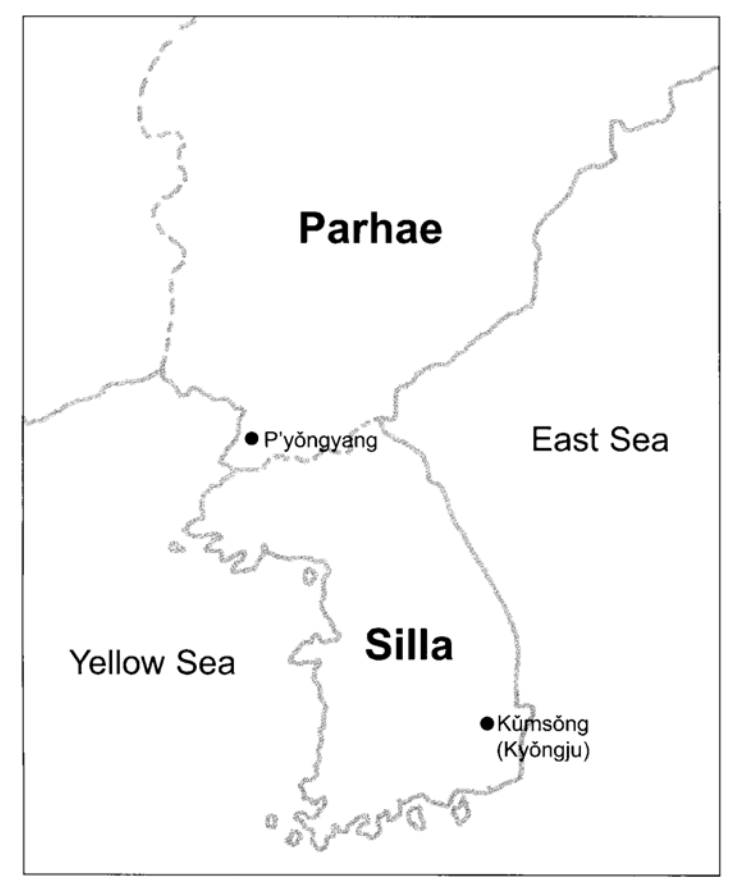
The Unified Silla period (668-935) was a prosperous time of sustained peace and stability. By 676, with the help of Tang China, Silla defeated and overpowered both the Paekche and Koguryŏ Kingdoms. In 698, the people of former Koguryŏ were incorporated into a mixed Korean-Manchurian state, Parhae, which stretched from eastern Manchuria to the northern half of the Korean Peninsula.