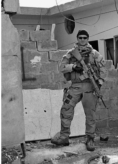
All kitted up with my Mk-12 sniper rifle, the gun I was carrying when I rescued the trapped Marines and reporters in Fallujah.