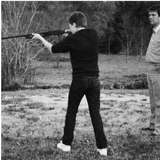
Here I am in junior high, practicing with my Ithaca pump shotgun. Ironically, I've never been much of a shot with a scattergun.