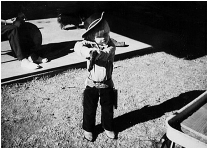
Stick 'em up, Yankee . . .