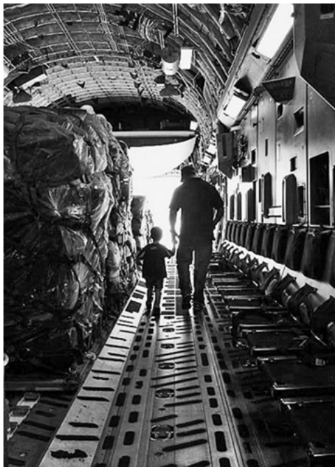
My son and I check out a C-17.