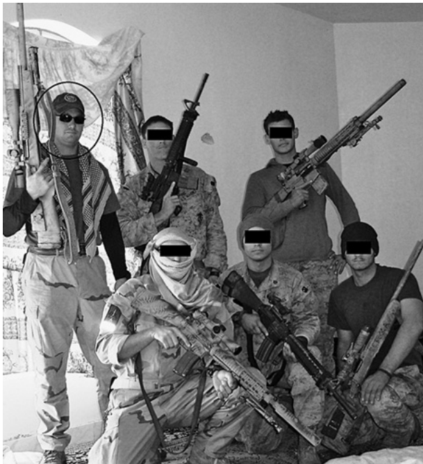
Fallujah in '04. Here I am with my .300 WinMag and some of the snipers I worked with. One was a SEAL, the others were Marines. (You can tell their service by the camis.)