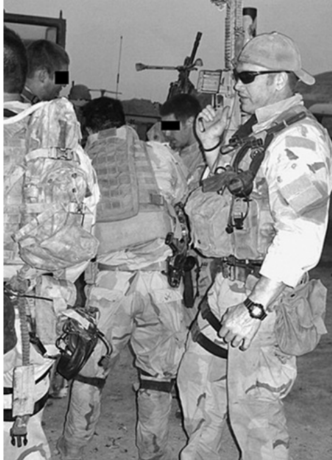
Here I am with the boys in '06, just back from an op with my Mk-11 sniper rifle in my right hand.