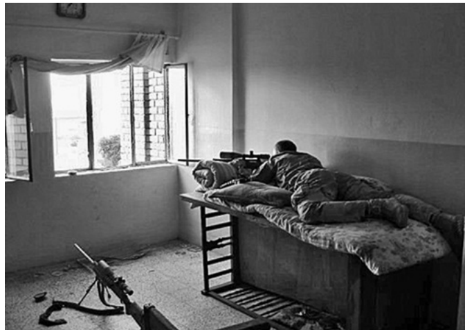
The sniper hide we used when covering the Marines staging for the assault on Fallujah. Note the baby crib turned on its side.