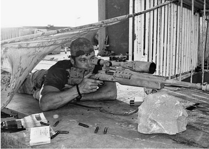
Another sniping position I used in the same battle.